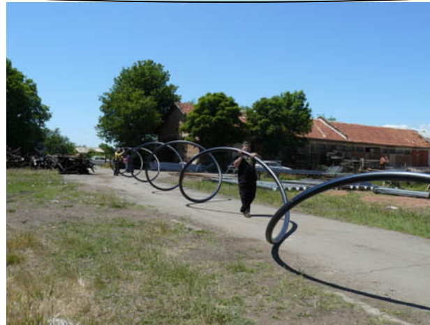
Pipeline connecting the vertical shaft and the open reservoir