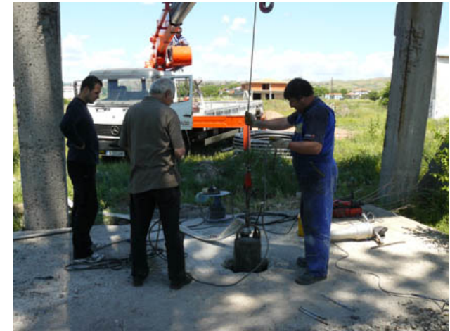
Lowering the submersible pump for the first test, May (27-28)